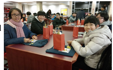
Welcome Night for International Exchange Students

JTHS recently hosted 27 students and 3 teachers from China. Host families were selected for the students to stay with and shadow buddy students at the high school provided daily partnership as they enjoyed a full week's worth of classes. A completion ceremony was held on Tuesday with the presentation of certificates to the exchange students, host families, and our own JTHS students.