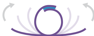
Curl ends up and tape together

Use tape to make a paper chain out of the individual strengths. You can hang the chain on the wall and keep adding to it as your child gains new skills.