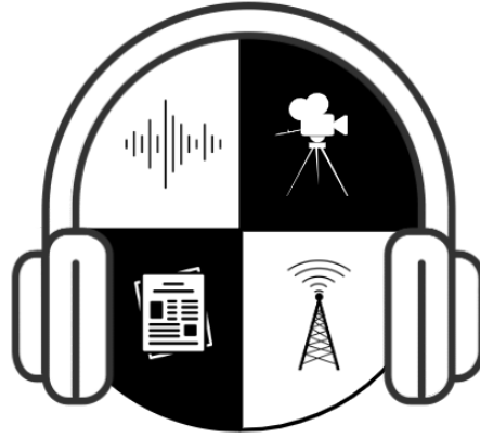
Multimedia, Broadcasting, and Academy Logo